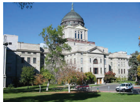
Montana Capitol Building, Helena, MT