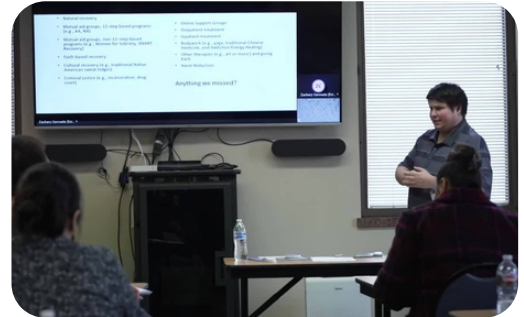
A Peer Support Specialist cohort is trained in Missoula, Montana.

Through a six-month program, participants gain hands-on experience and complete targeted coursework in trauma-informed care, suicide prevention, and motivational interviewing. With a focus on supporting youth impacted by trauma and behavioral health challenges, the program equips graduates to provide vital care in underserved communities.