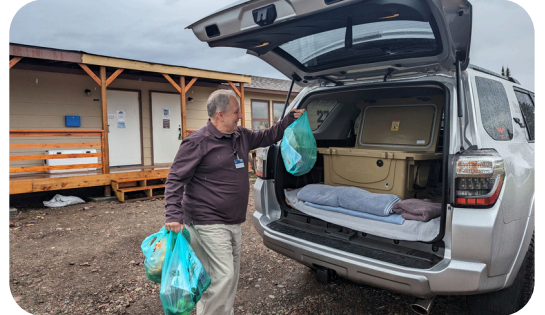
A Community Health Worker trained by MT FSP providing Food Rx services to rural communities in the Flathead Valley.

Through foundational courses, participants gain the skills needed to serve in roles such as Community Health Workers, Community Paramedics, Behavioral Health Technicians, and Recovery Doulas. The program also includes required developmental trainings focused on trauma-informed care, adolescent support, stigma reduction, and crisis intervention. This comprehensive approach builds a qualified, community-based workforce equipped to meet Montana's urgent behavioral health needs.