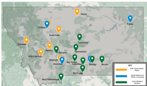
BHWET-East grant recipient clinical locations for the 2022-2023 Academic Year

Goal: Increased access to quality and culturally appropriate behavioral health services in eastern and north central Montana through a partnership between MRJCON DNP-Psych/Mental Health Track, MSU Billings College of Health Professions and Science, and the Billings Clinic Psychiatry Residency Training Program.