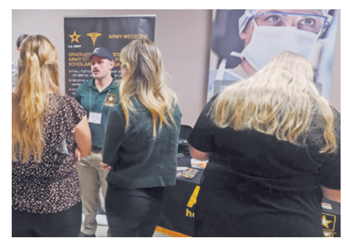
The US Army hosted a table at the PreMed Summit and answered students' questions.

Montana WWAMI organizes a pre-med summit every year for those interested in finding out more about the medical school application process. The 2024 event was held at Carroll College in Helena on September 28th. There were over 100 attendees, mostly undergraduate students. In addition to Q&A with current Montana WWAMI students, breakout sessions included information about loan repayment programs, preparing for the MCAT, pre-med research opportunities, and application advice. Also included was a Q&A session about the Montana TRUST program and the combined MD/PhD program.